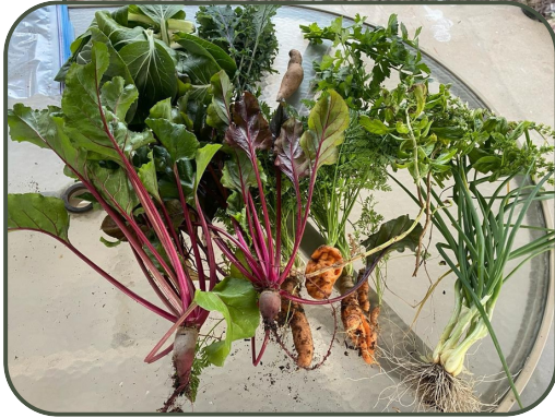
Meal prep harvest, February 24, 2024

What of the garden? Since the project, the garden has continued its growth and evolution. The winter season gave beets, carrots, bok choy, cilantro, broccoli, and kale. Most of these had self-seeded from the previous year. A thick layer of mulch was added to the ground to protect the ground, capture moisture, and provide nutrients to the soil. As we are approaching Easter, tomatoes, eggplants, lettuces, sunflowers, sweet peas and strawberries are growing. The leaves of the fig trees are coming back, and there is hope to harvest bananas, guavas, and pomegranates this year. When the weather allows it, the lunch is served in the garden, so residents can watch the plants, the birds, and all the life growing and transforming at its own pace. A composting program will be rolled out at the end of the year to return the nutrients into the soil, and the caregiving team is developing new recipes to further integrate the edible plants in the meals served at Apollo.