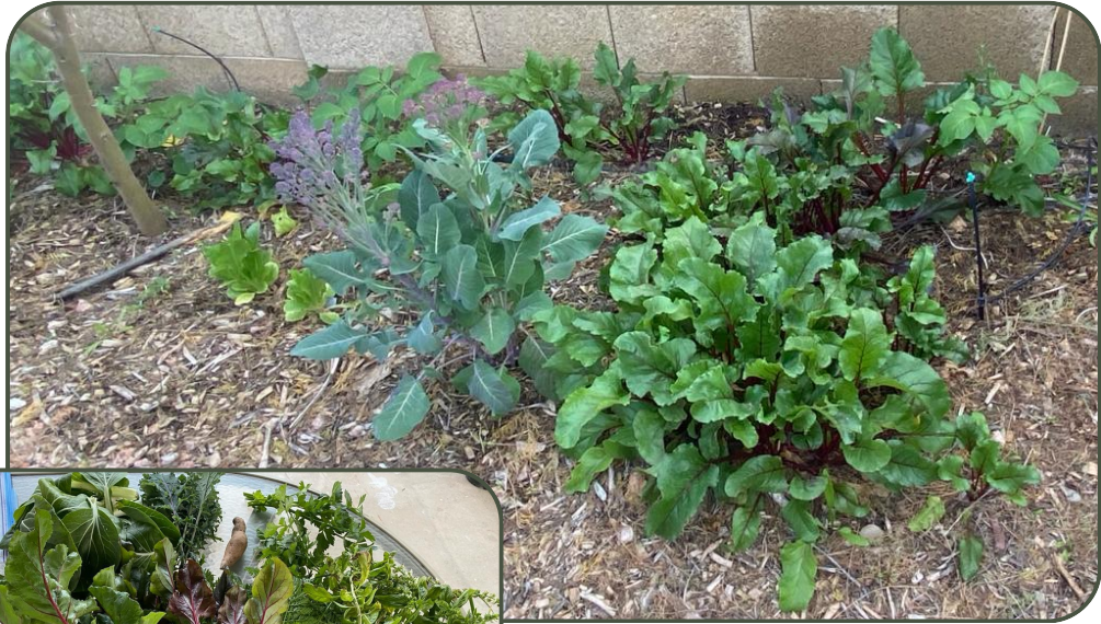
Beets, lettuce, potatoes, and broccoli